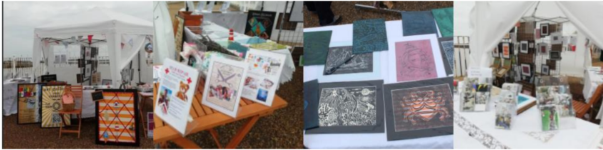
Display and showcasing work at The Excelsior Centenary

And, one week later on the 19 September the superb Herring and Ale Festival on the cliffs in Pakefield with the Oddfellows Arms was an absolute delight. Again, a chance for us to be involved and get some audience participation with our printing 'taster' sessions.