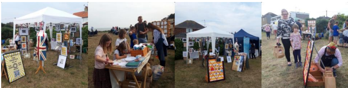
Our stand and print taster sessions at The Herring and Ale Festival at the Oddfellows Arms, Pakefield Cliffs

And, one week later on the 19 September the superb Herring and Ale Festival on the cliffs in Pakefield with the Oddfellows Arms was an absolute delight. Again, a chance for us to be involved and get some audience participation with our printing 'taster' sessions.