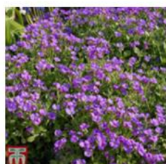
Aubrieta 'Cascade Purple'