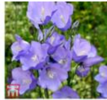
Campanula Medium 'Blue'