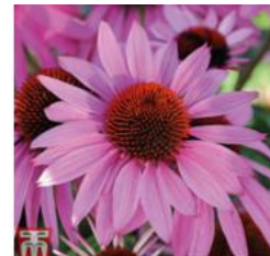
Echinacea 'Nectar Pink'