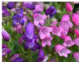
Penstemon 'Miniature Bells'