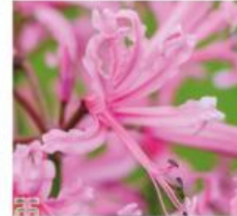
Nerine Bowdenii 'Pink'