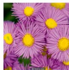
Erigeron 'Pink Jewel'