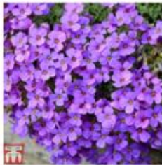
Aubrieta 'Cascade Blue'