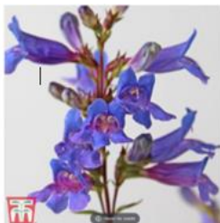
Pentstemon 'Heavenly Blue'

planting. The following planting plan is suggested: