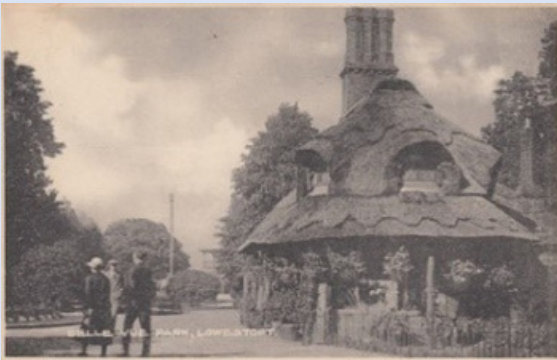
Ground Keeper Thatched Cottage

In August 1873 a tender of £256 from G Simpson was accepted to erect a thatched keeper's cottage, with a grounds keeper established in 1874 to oversee visitors to the park. In 1990 a fire destroyed the lodge, it was later rebuilt to the original design in 1991.