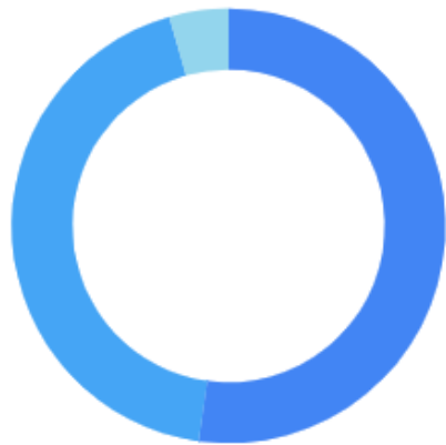
Sessions by device