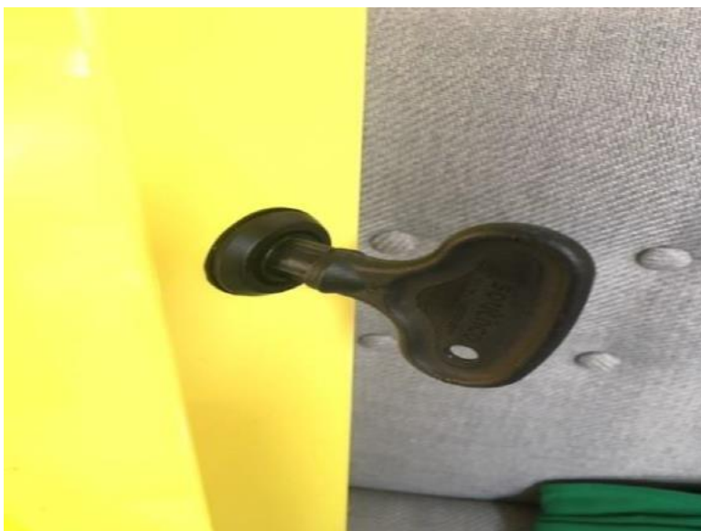
Key in lock