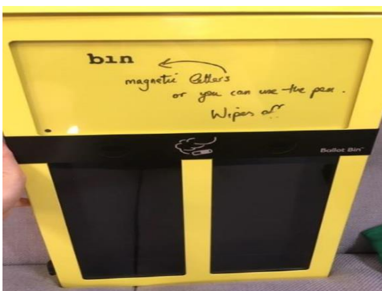
Front view. Noticeboard is behind screen and has either magnetic letters or a pen to write message