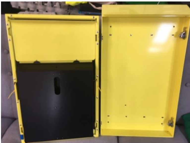
Inside view – access to message board and to empty bin