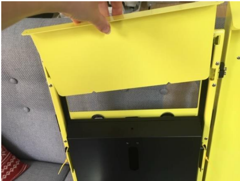
Message panel slides out