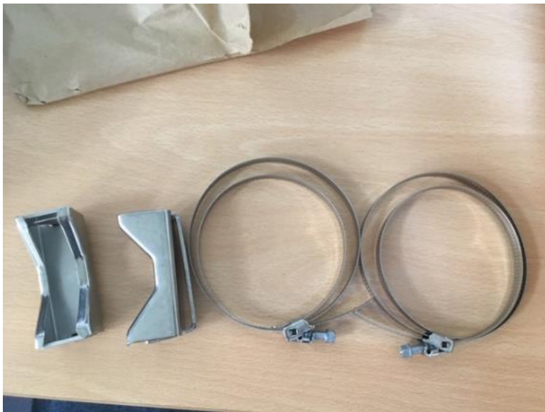
Other items for fixing to wall