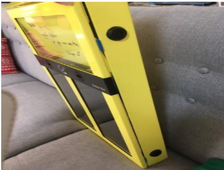
To access inside you have to have a key to open locks top and bottom