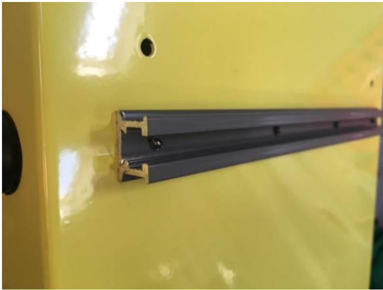
Close up of wall fixing