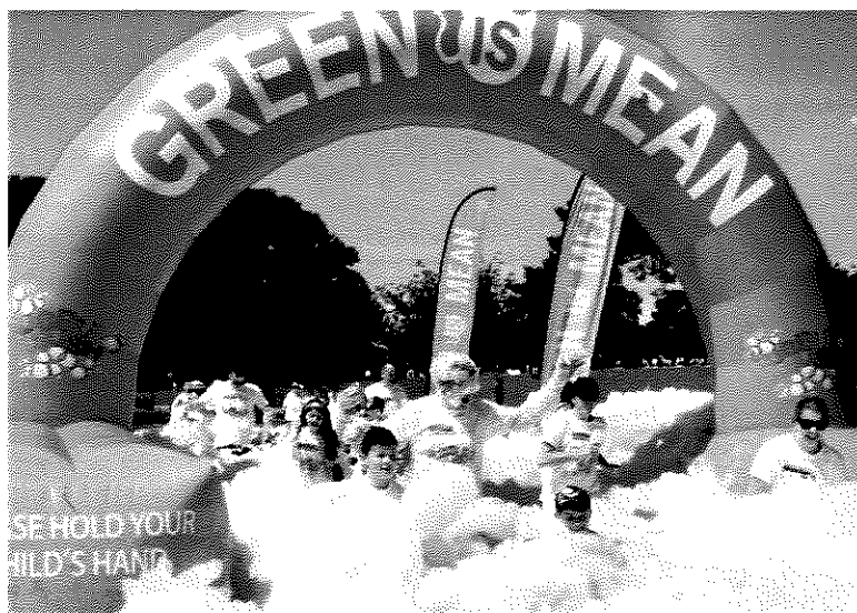
The East Coast Bubble Rush – a family-friendly 5k fun run with lots of colourful bubbles – was held at Normanston Park in Lowestoft on Saturday, June 22.

More than 400 people set off at 11am, with around 350 heading off at noon. They completed two laps of a winding 5Km course around Normanston Park passing four bubble stations along the way, where foam cannons pumped out masses of different coloured bubbles that created a bath of bubbles.