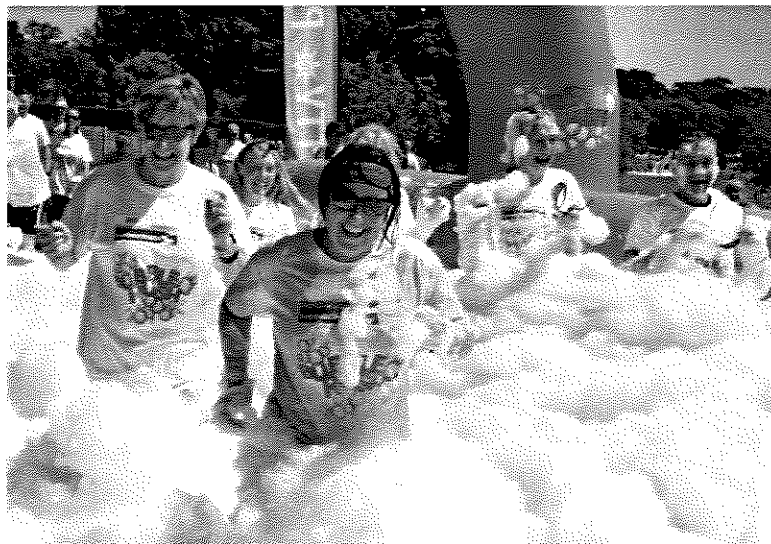
The East Coast Bubble Rush ♦ a family-friendly 5k fun run with lots of colourful bubbles ♦ was held at Normanston Park in Lowestoft on Saturday, June 22.

"Thank you to everyone that joined in the 'bubble' fun!