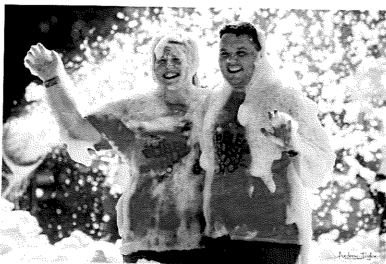
The East Coast Bubble Rush will be held for the first time in Normanston Park, Lowestoft. A previous Bubble Rush takes place elsewhere.

Lowestoft is set to be awash with bubbles as a charity fundraiser brings foam to the town this weekend.