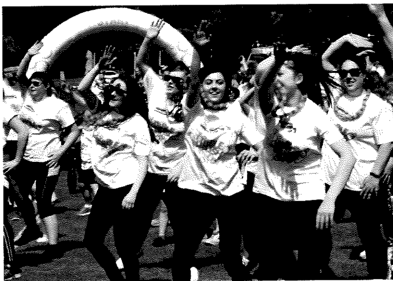
The East Coast Bubble Rush – a family-friendly 5k fun run with lots of colourful bubbles – was held at Normanston Park in Lowestoft on Saturday, June 22.