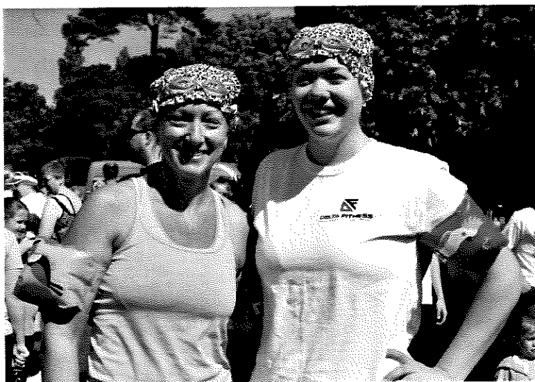
The East Coast Bubble Rush – a family-friendly 5k fun run with lots of colourful bubbles – was held at Normanston Park in Lowestoft on Saturday, June 22.