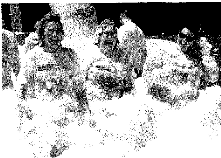
The East Coast Bubble Rush – a family-friendly 5k fun run with lots of colourful bubbles – was held at Normanston Park in Lowestoft on Saturday, June 22.