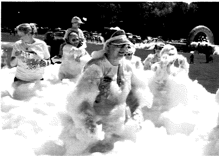
The East Coast Bubble Rush – a family-friendly 5k fun run with lots of colourful bubbles – was held at Normanston Park in Lowestoft on Saturday, June 22.

The East Coast Bubble Rush - a family-friendly 5k fun run with lots of colourful bubbles - attracted hundreds of families and friends.