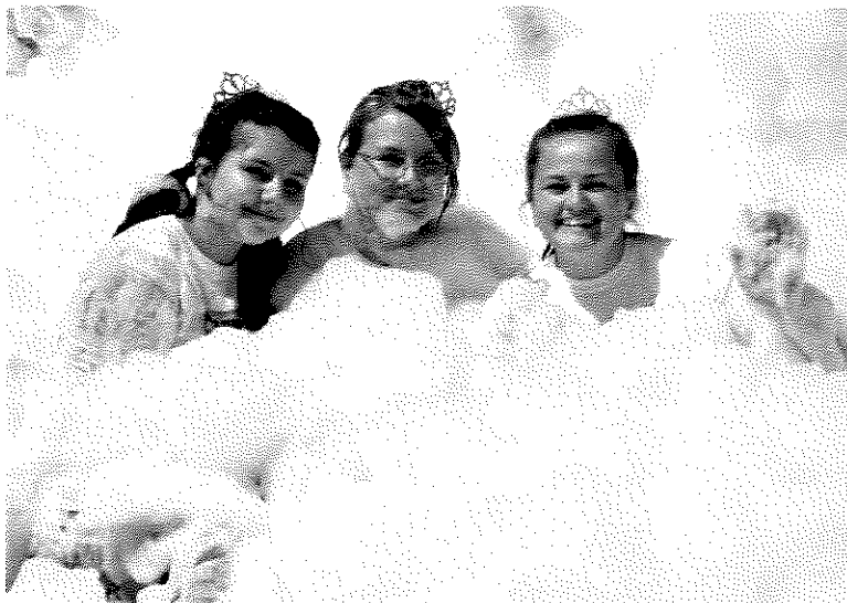
The East Coast Bubble Rush – a family-friendly 5k fun run with lots of colourful bubbles – was held at Normanston Park in Lowestoft on Saturday, June 22.

Masses of coloured bubbles were pumped out as a popular 5k fun run with a difference hit Normanston Park in Lowestoft on Saturday, June 22.