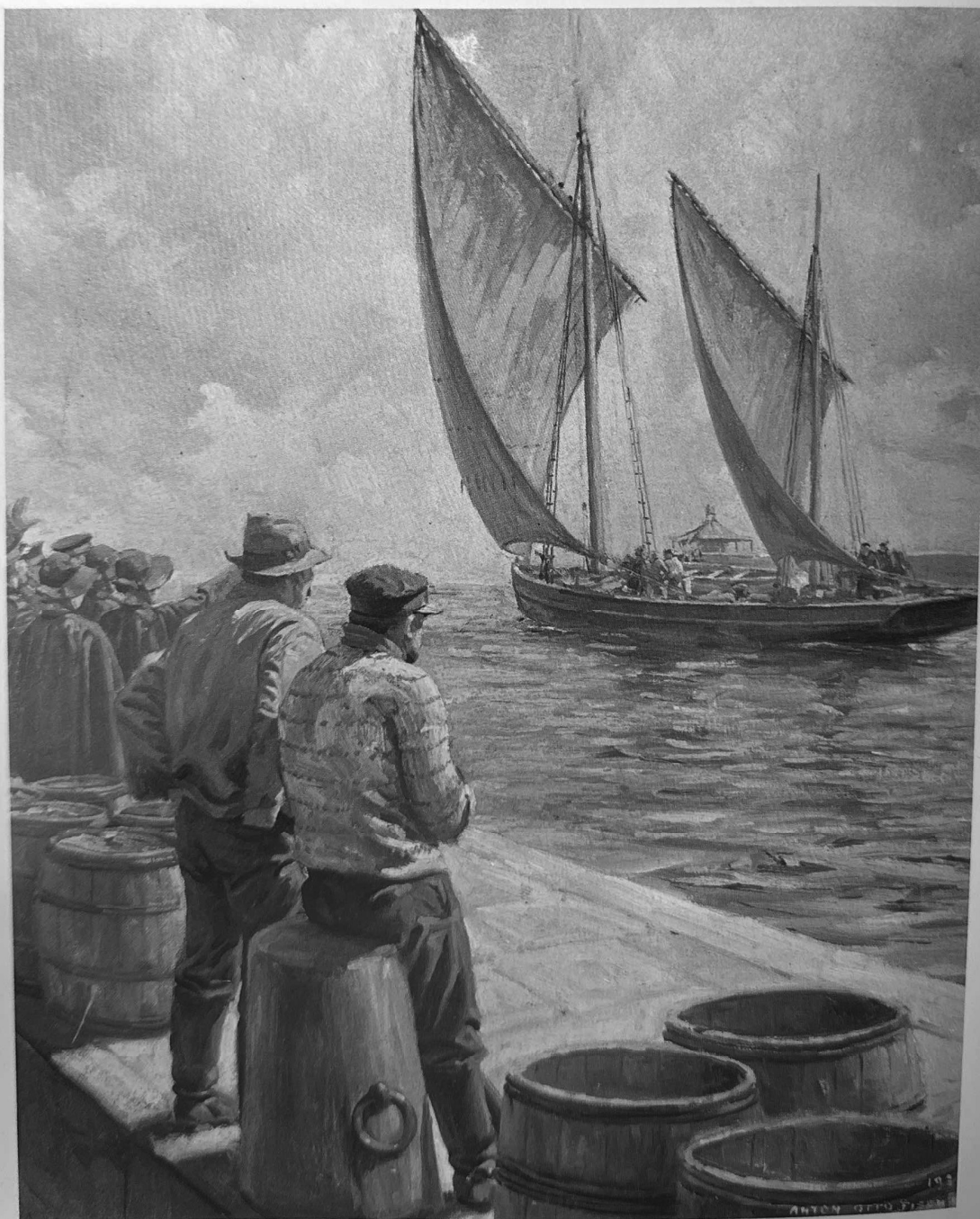
190. Bound for the fishing grounds.