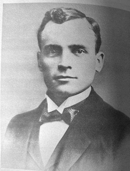
The Author at Age Twenty-seven.