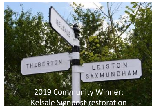
2019 Community Winner: Kelsale Signpost restoration