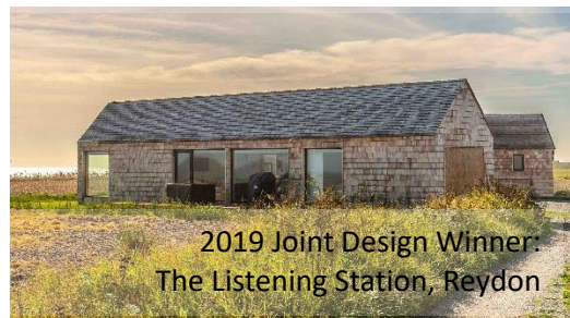
2019 Joint Design Winner: The Listening Station, Reydon

Award Categories: The four categories are: