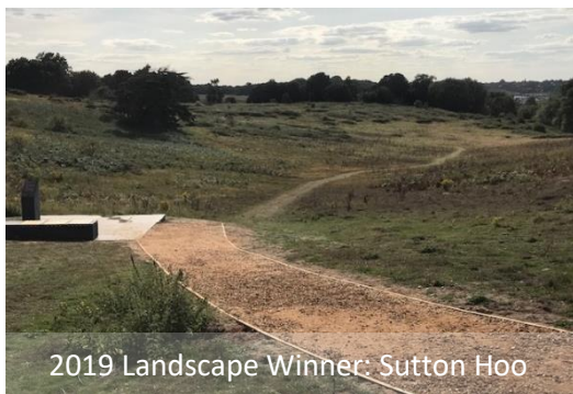
2019 Landscape Winner: Sutton Hoo

The Quality of Place Awards were held from 2010-2018 in Suffolk Coastal and have now been extended across the whole new East Suffolk Area. They aim to recognise and encourage an interest in the quality of the built environment within the District and promote awareness for the need for high standards in all forms of design.