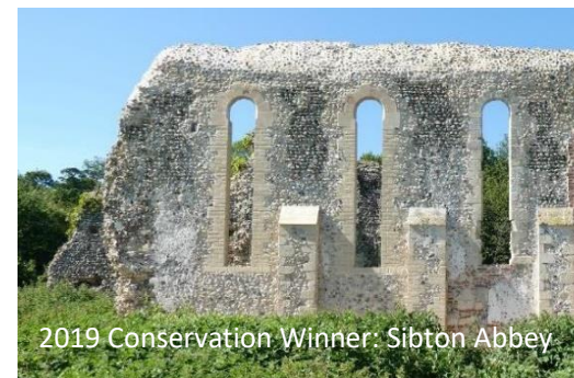
2019 Conservation Winner: Sibton Abbey