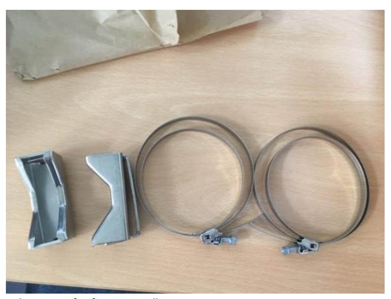
Other items for fixing to wall