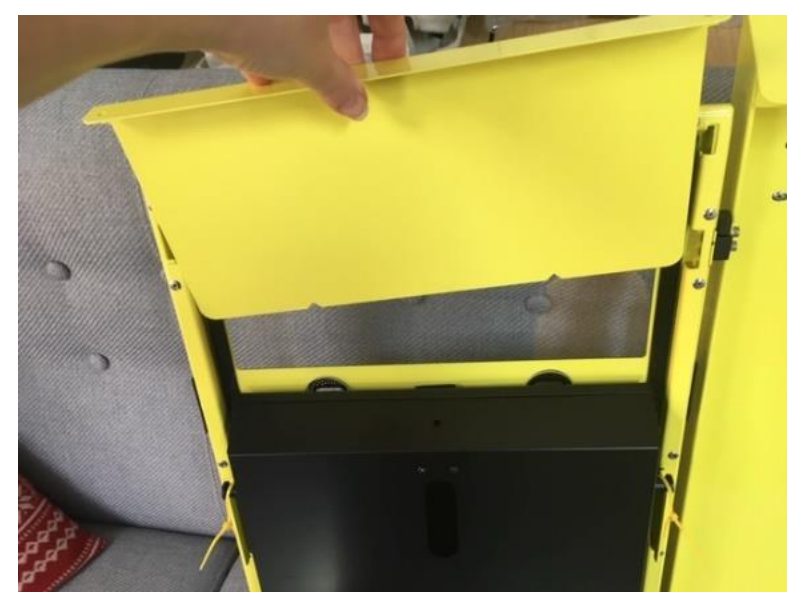
Message panel slides out