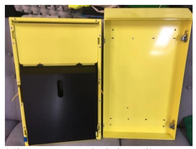
Inside view – access to message board and to empty bin