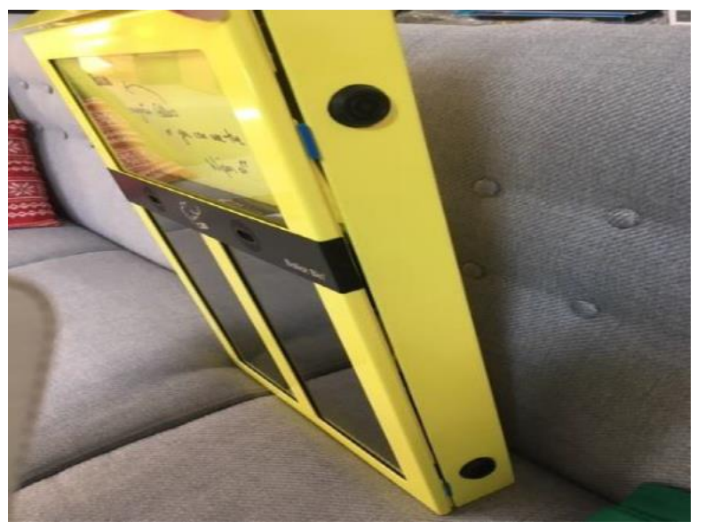
To access inside you have to have a key to open locks top and bottom