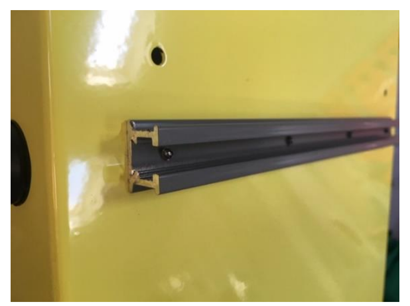
Close up of wall fixing