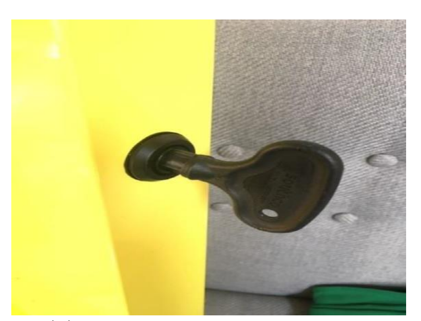
Key in lock